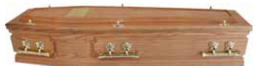
Westminster – Solid Oak (also available in Mahogany) £865