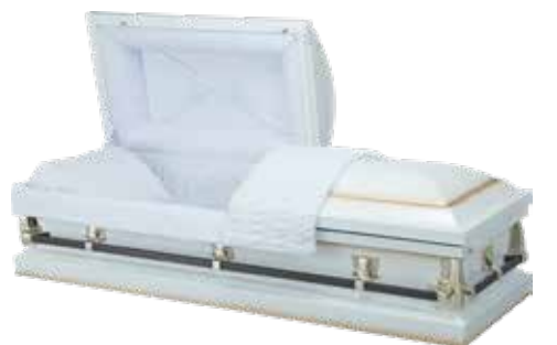
American-Style Caskets* American-style Caskets are available in wood or metal in a wide selection of designs From £1,470