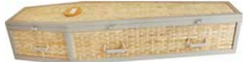
Premium Bamboo* £720