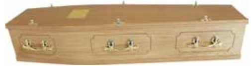
Rochester – Oak Veneer £520